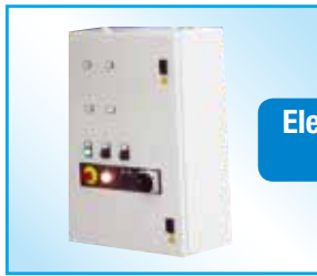
Electric Control Panel and Remote Control for Automatic Loading Operation